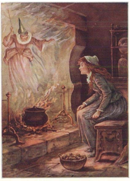
IT WAS HER PAIRY GODMOTHER!