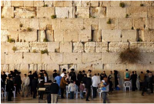
The Western Wall