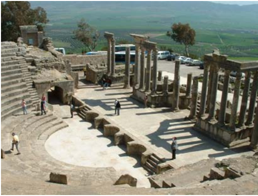
Dougga (or Thugga)