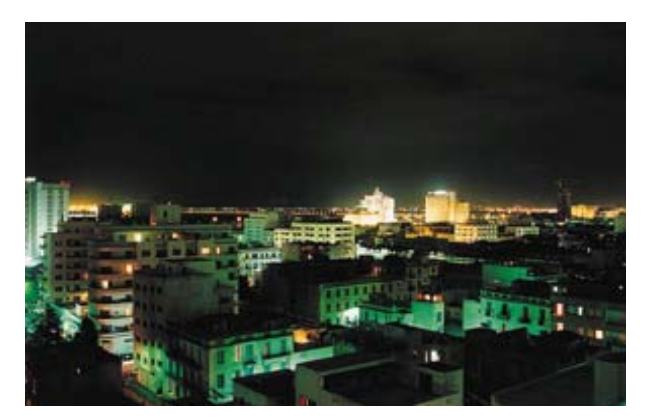
What is the capital of Tunisia? Tunis Situated on a large Mediterranean gulf, (the Gulf of Tunis), behind the Lake of Tunis and the port of La Goulette, the city's products include textiles, carpets, and olive oil. The population of the city's metropolitan area approaches two million.