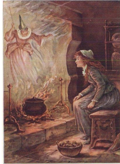
IT WAS HER FAIRY GODMOTHER!